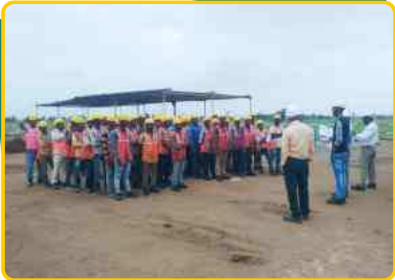
Site TBT (1)