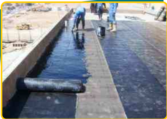
Slab Waterproofing work