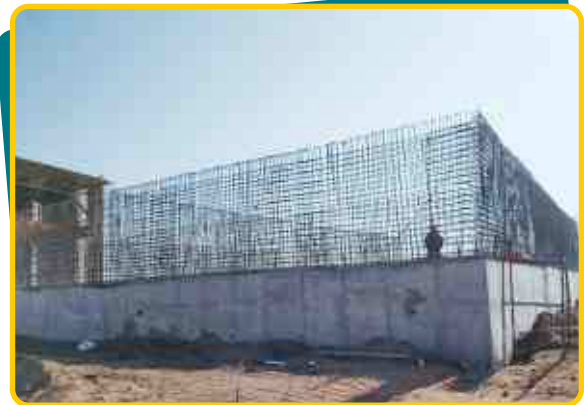
Construction of Fire Tank