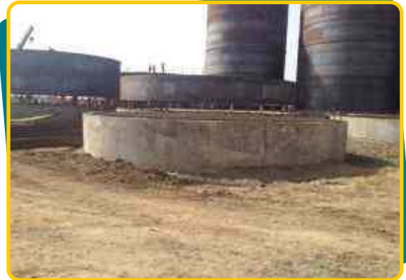
Rcc Tank Foundation