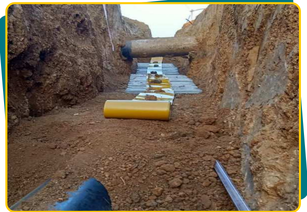
Pipeline Crossing Work