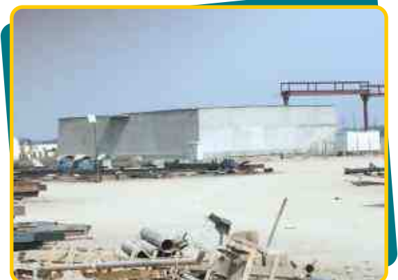
Construction of RCC Tank