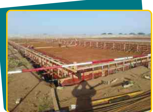
Shuttering Work Evaporating Tank