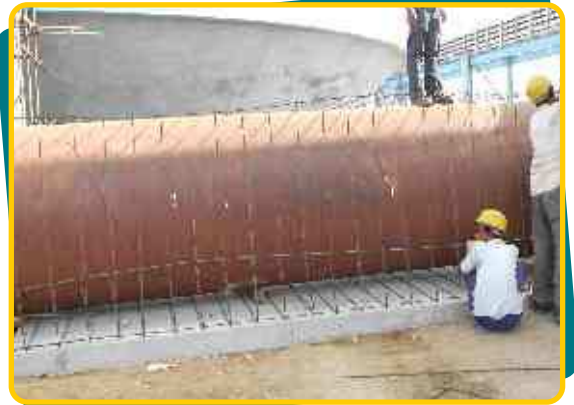
Pipe increasing with Thurst Block