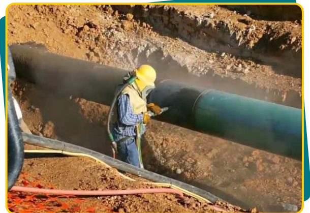
Sand Blasting Work