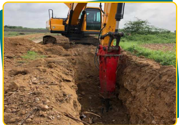
Line Rock Breaking Work