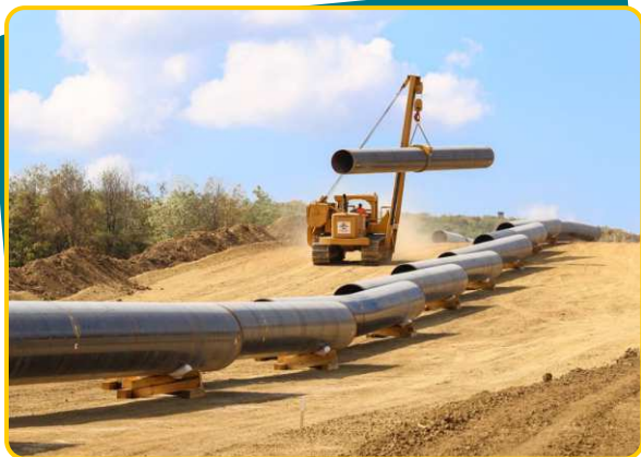
Pipe Stringing Work