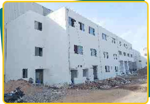
Exit Electric Building