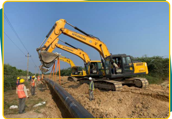
Main Line Loaring Work