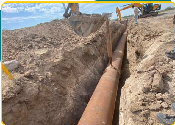
36 Dia Casing Loaring Work