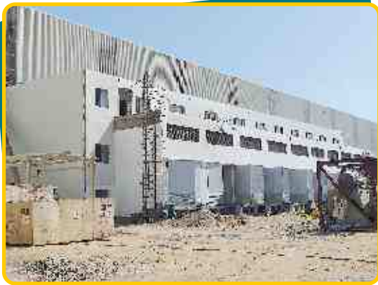
Entry Electric Building