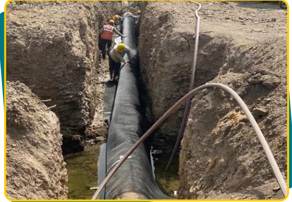
Rock Seal Covering