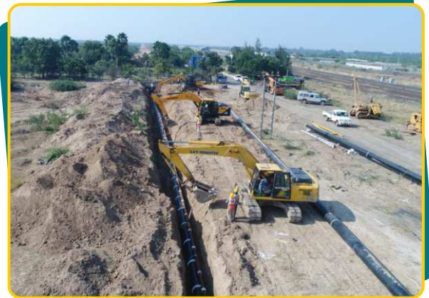
HDD Pulling Work