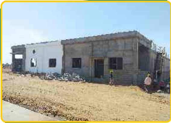
Fire Fighting Building and Tank