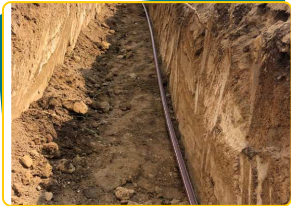
Duct Pipe Laying Work