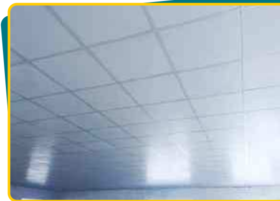
Roofing False Ceiling