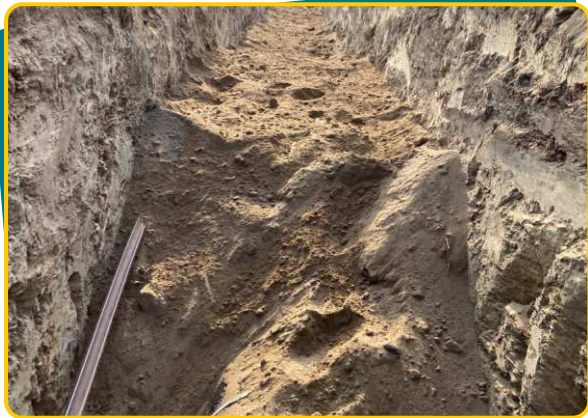
Rock Area Sand Padding Work