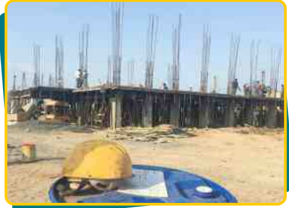
Building Work at IOCL Kandla