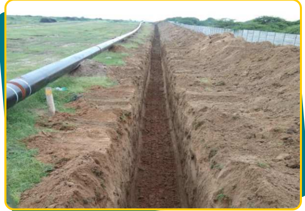
Main Line & Trench