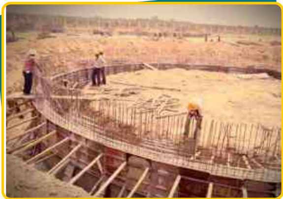
Make up Water line RCC Tank