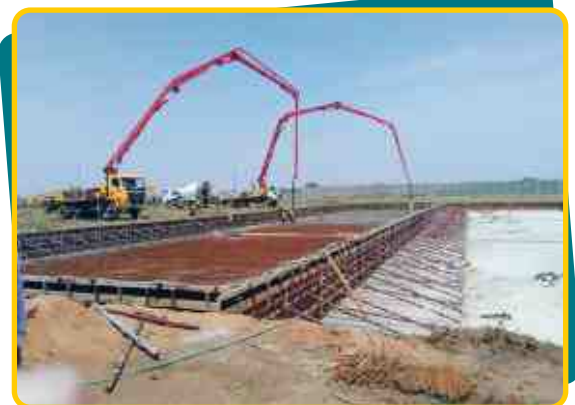
Concreting Evaporating Tank