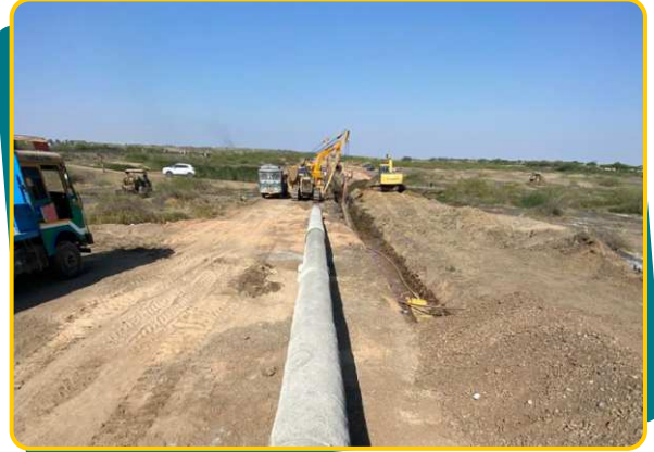
Concrete Pipe Coating Work