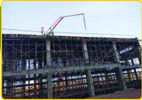
Slab Concreting Waste Water Treatment Station