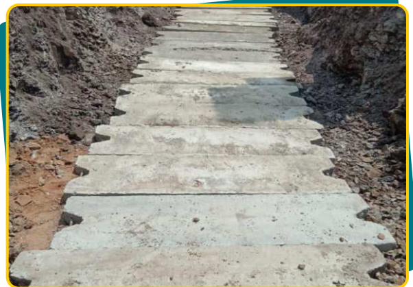
Road Crossing Concrete Slab Work