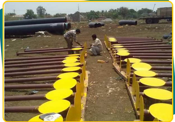
All Type of Permanent Markers of All Line