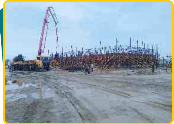
RCC Tank Work