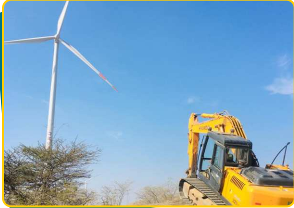
Wind Farm Work