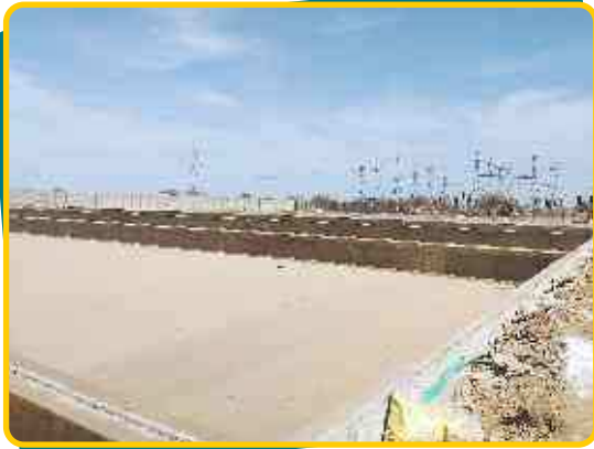
Evaporating Anti Corrosion Work