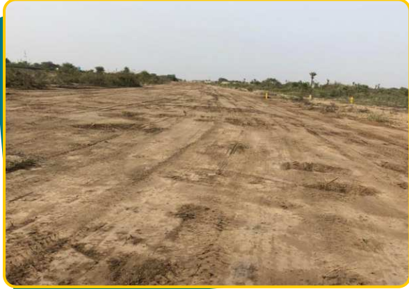
Row Grading Work