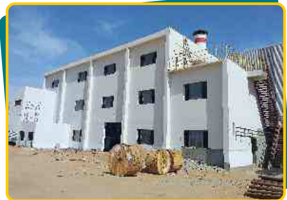
Waste Water Treatment Station Building