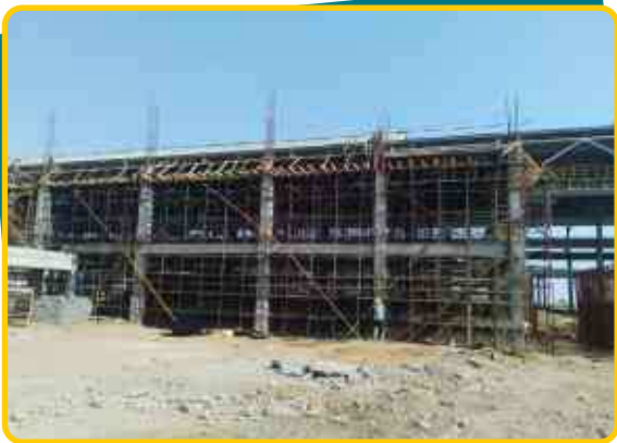
Scaffolding Arrangement for Waste Water Treatment Station