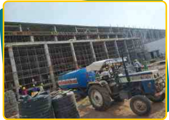
Slab Scaffolding Arrangement for Entry Electric Building